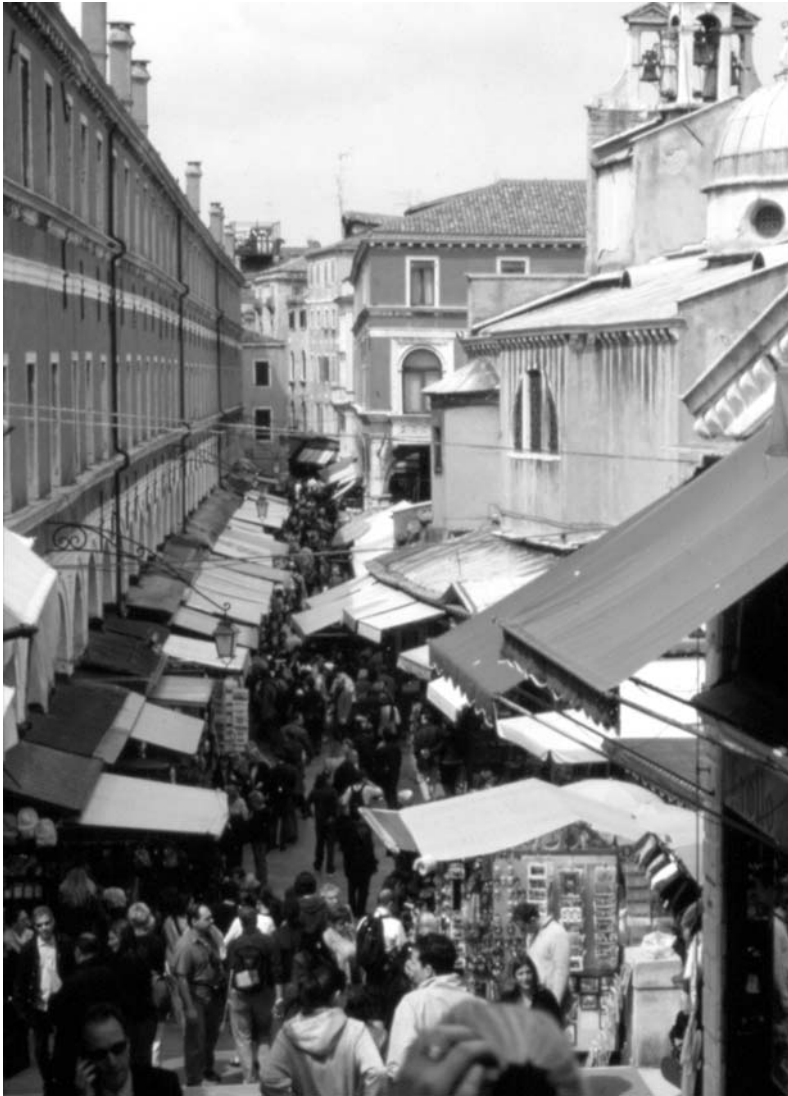
Figure 1.1 The city as a myriad of diverse and intense activities – the driving force for cultural activity: Venice, 2002.

material for a symbolic and collective community memory. The layouts, landmarks and public spaces all contribute to each city's distinctive sense of identity (Figures 1.2 and 1.3).